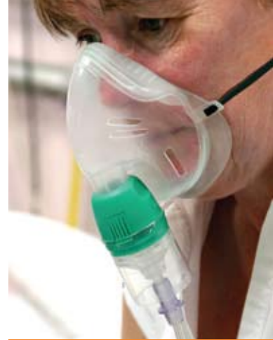
Oxygen & aerosol therapy