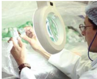
Quality control and testing